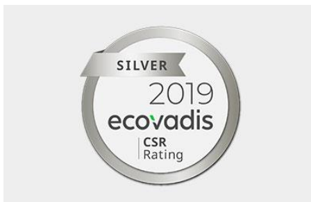
EcoVadis Silver Rating

www.mercateo.com/corporate/presselounge/pressemitteilungen/